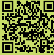
Global MBA, University of London

To apply for Preparatory Courses for Global MBA, applicants must first apply online directly with the University of London. After receiving a confirmation email from the University of London, a completed HKU SPACE application form should be submitted to HKU SPACE office.