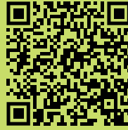
Preparatory courses for Global MBA, HKU SPACE