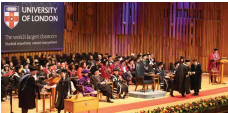
Celebrate Your Graduation - When you complete your qualification, you will receive an official University of London award. And, you will be invited to attend the annual graduation ceremony in London.

The Global MBA offered by the University of London (Academic Direction from Queen Mary University of London) equips you with a well-informed understanding of the pressures and challenges facing today's global business leaders, whilst enabling you to implement cutting-edge approaches to management that will ensure success in your future roles. HKU SPACE provides face-to-face tutorial support for the Global MBA.