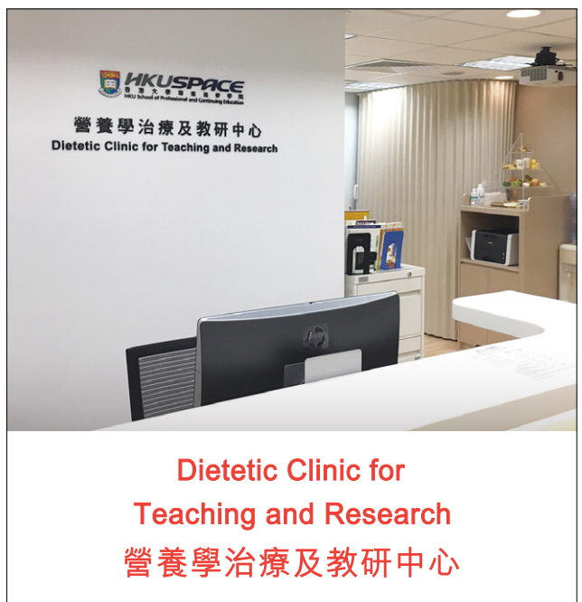
Dietetic Clinic for Teaching and Research 營養學治療及教研中心